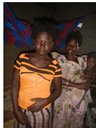
Two local women at home during a net follow-up visit.

This year, our malaria team visited 54 new villages, providing those communities with much-needed education and prevention outreach. We also sold 1,724 nets to people in need. In addition, the team made 944 follow-up visits to net purchasers' homes to track how people were doing with their nets and whether they reported having less malaria. As we move further away from the effects of the 2013 free net distribution, we are confident there will be an increase in net sales.