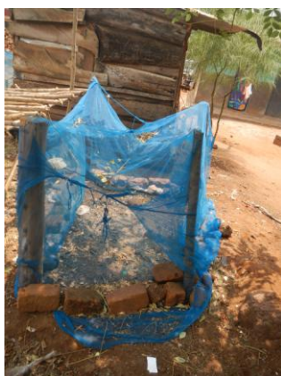
A free mosquito net being used to cover a garden bed.

An unintended consequence of the free distribution, which has been observed in Uganda and elsewhere, is that people who don't know how and why to use the nets, and who place no value on the nets, end up using them in inappropriate ways and for purposes unconnected to malaria prevention. For example, we have seen numerous nets used to fence people's gardens and to help enclose people's chickens. It is also not uncommon to see the nets used as fishing nets along the Nile. The latter use is having a catastrophic effect on the fish populations by wiping out the baby fish numbers entirely. Although there seems to be more awareness of the unintended down-sides of free net distributions, it seems that policy makers are still unwilling to change their approach. This may end up having even bigger negative consequences for the people of Uganda. Not only will malaria remain a top killer disease, but also fish, an important source of food for the population, may be depleted or completely wiped out by fishing with mosquito nets.