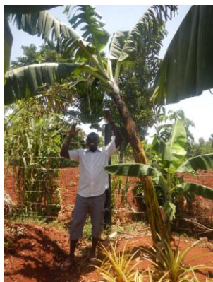
Patrick and the matooke crop in our DIG garden.

participants in the program. Happily, the follow up data showed that over 90% of those who attended the malnutrition education sessions retained knowledge and put it to good use. This stands as yet another confirmation that education is a key to helping people live healthier and better quality lives in Uganda. Soft Power Health is grateful for the continued support of this program by the Deerfield Foundation.