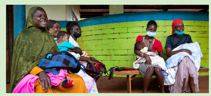
Mothers gather with their babies for immunizations at the clinic.

Statistically, routine childhood immunizations around the globe are down, making once disappeared deadly diseases like measles and polio emerge again.