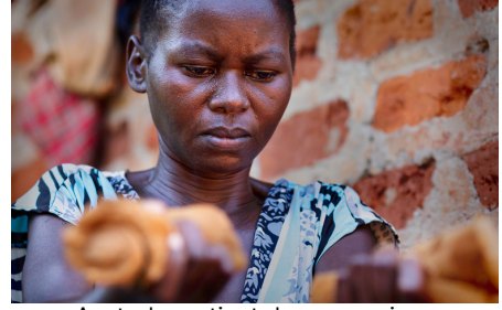
A stroke patient does exercises with SPH physiotherapists in 2019.

Underlying causes of hypertension remain unclear, but treatment in the form of isometric handgrip exercises make it possible to reduce the serious health sequelae seen in Uganda and throughout the world. These exercises have been shown to lower blood pressure as much as 30% - a promising development for hypertensive patients everywhere.