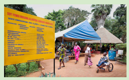
Soft Power Health's main intake area.

Soft Power Health treated over 30,000 patients in 2021 and referred 2,000 more for surgery and tertiary care. With over 20,000 people receiving community based health education, prevention, and treatment in combination with 30,000 clinic patients served, over 50,000 people directly benefitted from Soft Power Health's work!