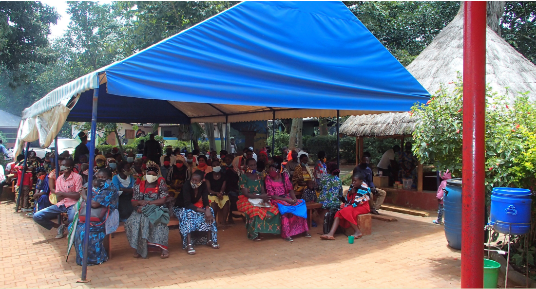
Patients waiting on a busy Monday morning at the clinic. Patient numbers are back to pre-pandemic range.

Through healthcare service to people in need, we take a step towards making a more just world