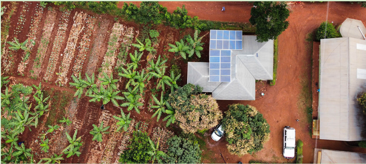
The new solar panel system installed and supplying reliable electricity to power the entire clinic.

Thank you to everyone who made it possible. We really appreciate your help!