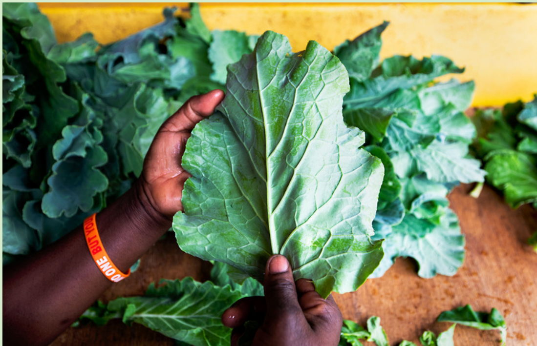
Kale picked fresh from the home garden to be used in the staff mid day meal.