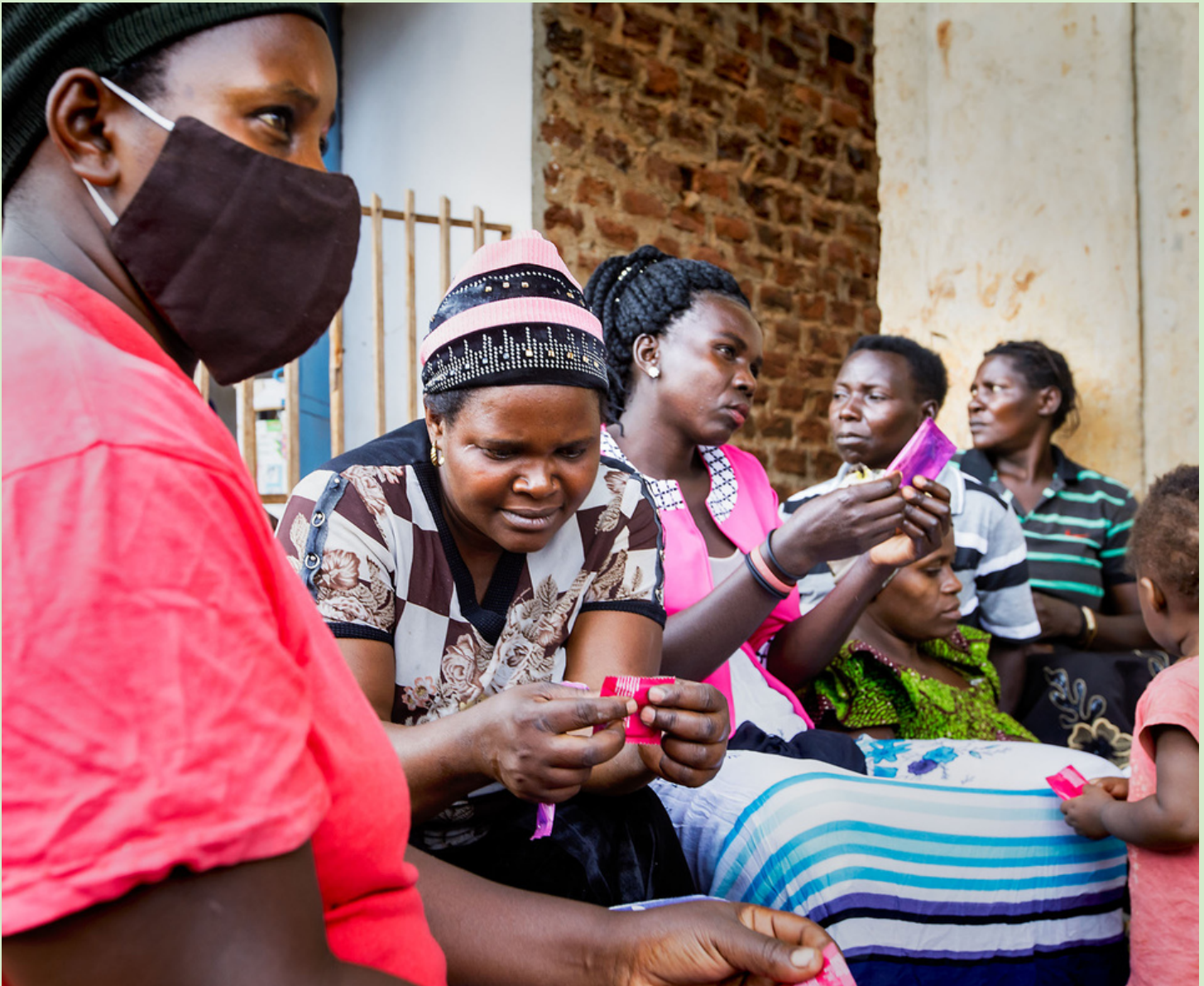
Women inspect male and female condoms during a family planning outreach session.

A total of 924 long-term family planning methods were administered in outreach and clinic during Q3.