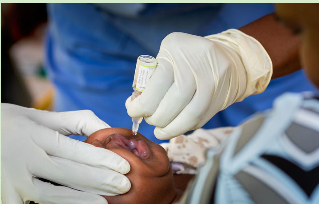
An infant receives oral polio immunization at the clinic's Friday vaccination days.

84 treatments given to 43 cerebral palsy patients.