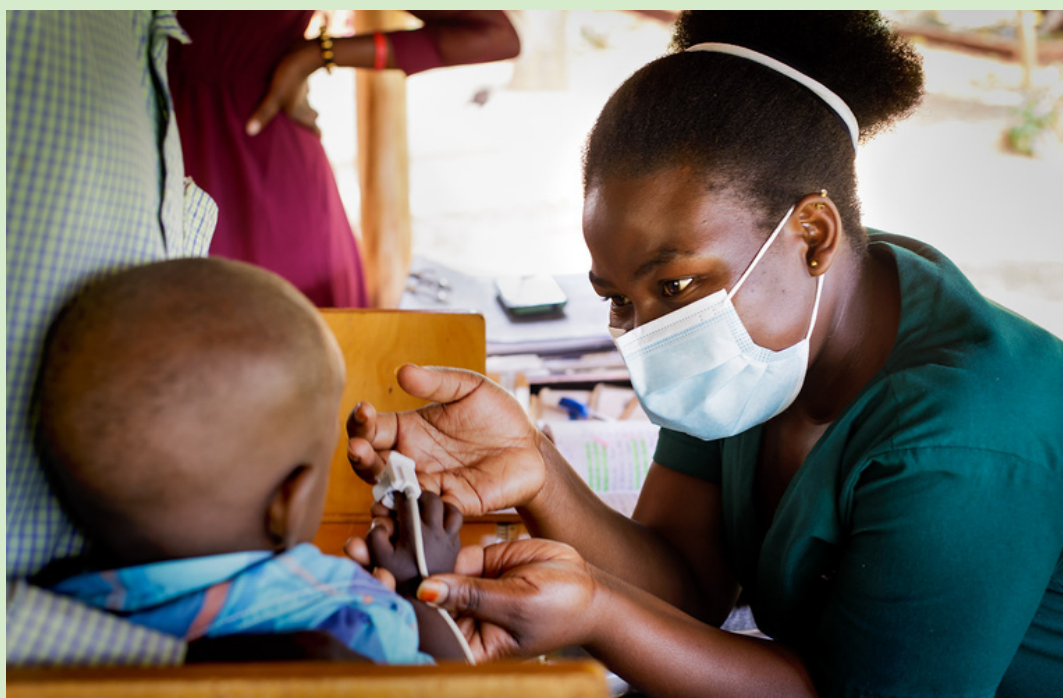
Loy measures the oxygen level of a young patient in triage.

PEDIATRIC PATIENTS TRIAGED: 1,626 = 21% OF ALL CLINIC PATIENTS IN Q3.