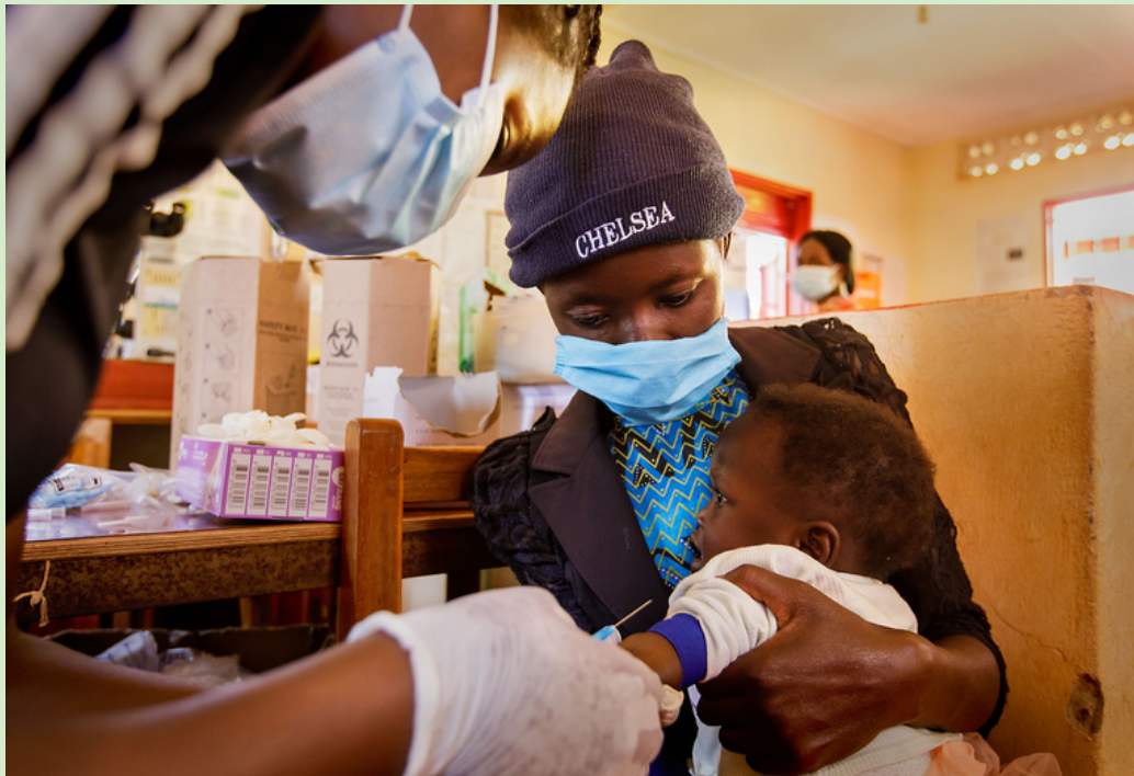
Blood is drawn from a young patient at the clinic lab.

Complete Blood Count Tests = 5,637; Urine Tests = 4,240; Malaria Blood Smear = 3,990 (9% positivity rate); Malaria Rapid Test = 4,910 (13% positivity rate); H. Pylori = 1,805 (44% positivity rate); HIV = 2,981 Tests at a 2.4% positivity rate; TB = 180 Tests (7% positivity rate); HCG Pregnancy Tests = 402; Hepatitis B = 233 Tests (41% positivity rate)