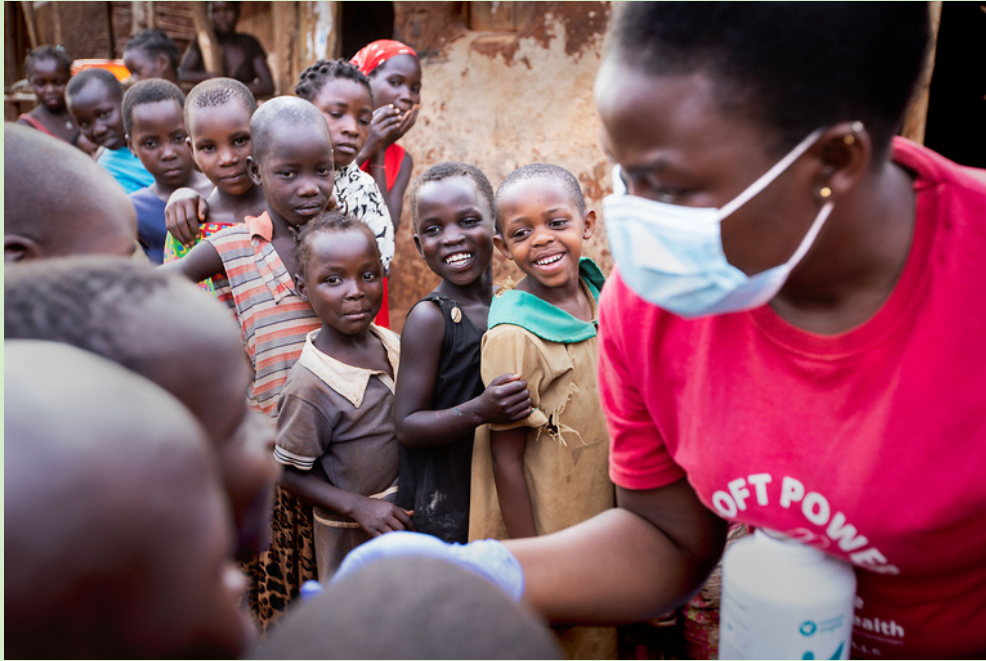
Children line up to receive albendazole in Kakira.