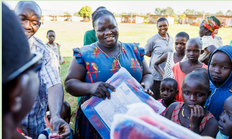
After a well-attended malaria education session in Kakira, the ensuing net sale was a big success.

434 people educated during outreach in 18 villages; 507 attendees to malaria education sessions; 73 follow-up visits in 12 villages. 203 nets sold in outreach and 307 nets sold at the clinic.