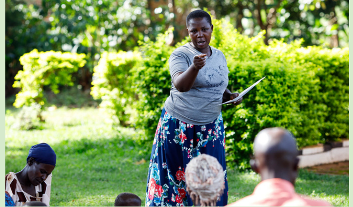
Leading a question and answer session during outreach.