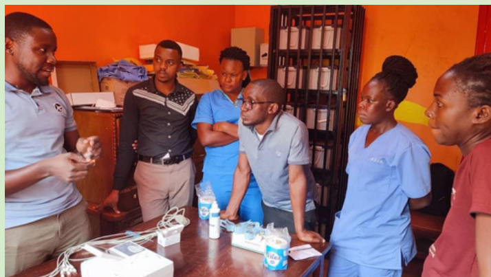
Medical staff receive training on how to use the new EKG machine.