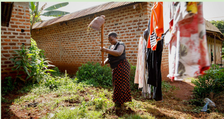
Digging a new garden spot outside her home.